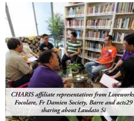
CHARIS affiliate representatives from Loveworks, Focolare, Fr Damien Society, Barre and acts29 sharing about Laudato Si

Participants interviewed said that faith formation and a desire for a deeper understanding of the Christian faith were the main reasons for attending these talks. They spoke about the need