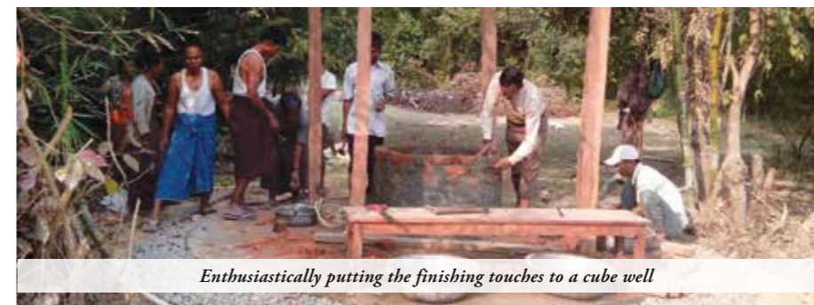
Enthusiastically putting the finishing touches to a cube well

In August 2015, CHARIS responded to the disaster, which resulted in a flood that left 1.6 million displaced and at least 117 people killed by pledging an initial sum of SGD 100,000 for aid and disaster relief supplies to Caritas Myanmar (KMSS). In October 2015 CHARIS granted SGD 86,000 to KMSS for their project to rehabilitate 4 ponds and wells, which had been contaminated by floodwaters and rendered unsuitable for drinking. This also included repairing gravity flow water systems in 7 villages in the Chin State. On a whole, both these projects would benefit at least 6,505 people living in the area.