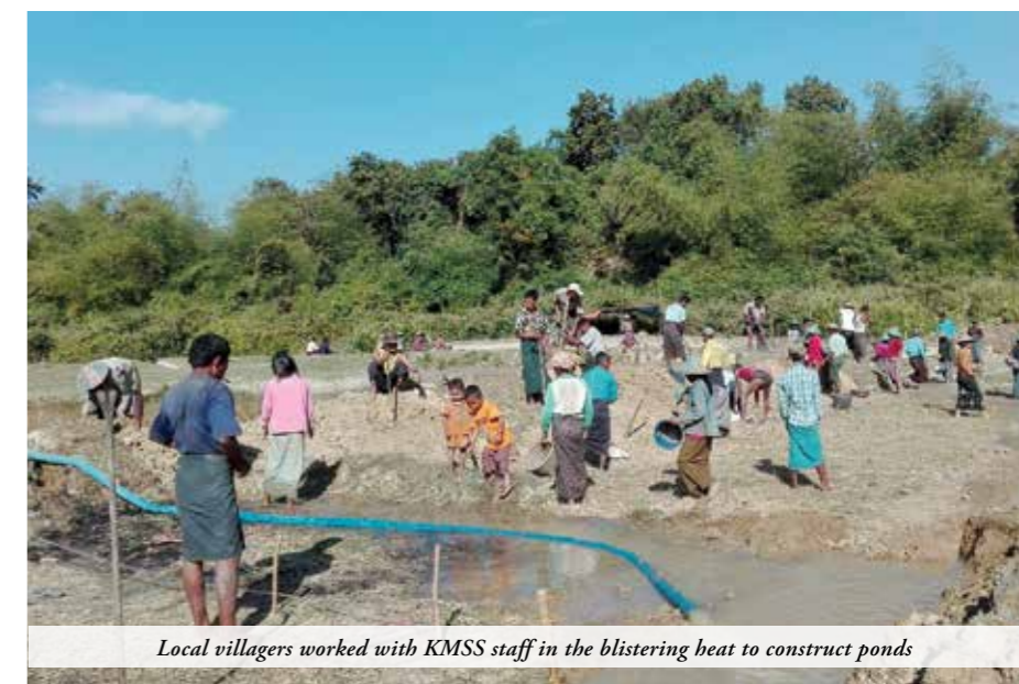
Local villagers worked with KMSS staff in the blistering heat to construct ponds

In late February 2016, our partner Caritas Myanmar successfully completed 4 ponds, which not only provide a natural embankment for future floods but also a catchment and fresh water source for local villagers. This was a landmark achievement for them as they were faced with a variety of challenges such as language barriers, limited manpower and poor transportation routes.