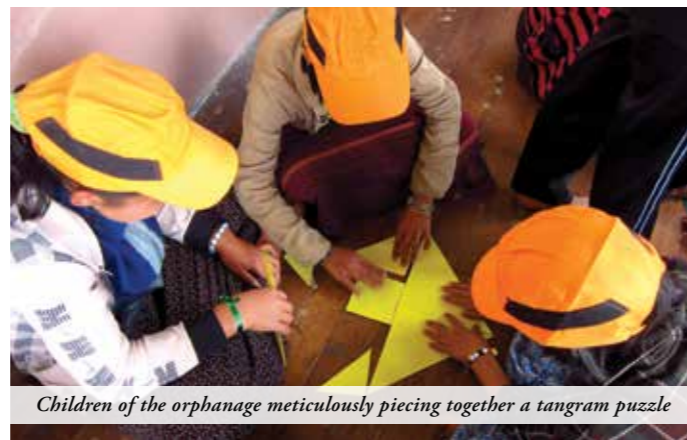
Children of the orphanage meticulously piecing together a tangram puzzle

The group plans to reach out to more orphanages, particularly in the poorer ones in Pekon Township. They hope to empower the older youths in these orphanages to facilitate in future activities. Project Micah hopes to inspire the future of Myanmar to "act justly, love tenderly and walk humbly", just as how the prophet Micah has inspired them.